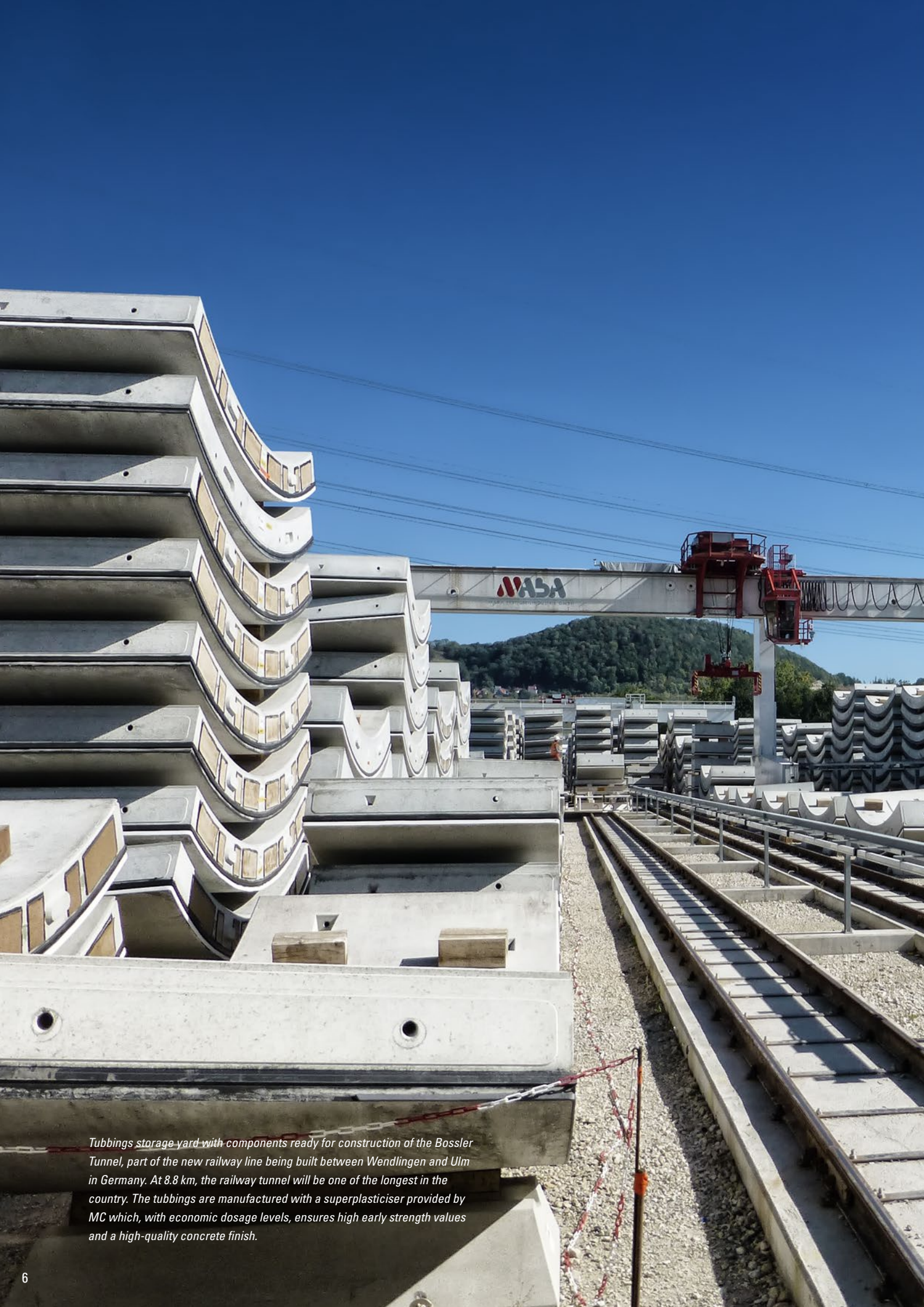
Tubbings storage yard with components ready for construction of the Bossler Tunnel, part of the new railway line being built between Wendlingen and Ulm in Germany. At 8.8 km, the railway tunnel will be one of the longest in the country. The tubbings are manufactured with a superplasticiser provided by MC which, with economic dosage levels, ensures high early strength values and a high-quality concrete finish.