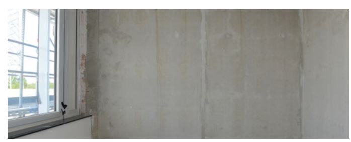
Untreated concrete surface