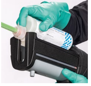
Insert cartridges in the MC-Fastpack Power-Tool dispenser.