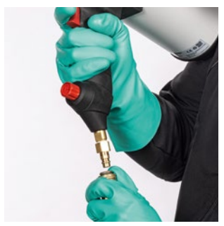
1. Connect air compressor.