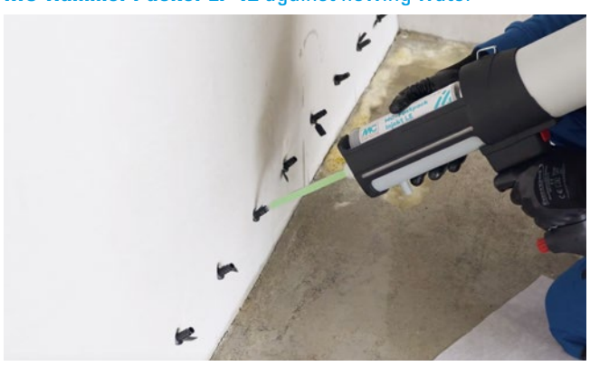
Wide area injection with MC-Fastpack 2700 via MC-Hammer Packer LP 12 into a damp component