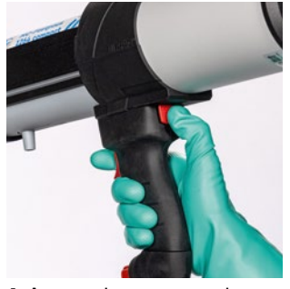
Actuate the pressure release button before switching to the next packer and also before any cartridge replacement.