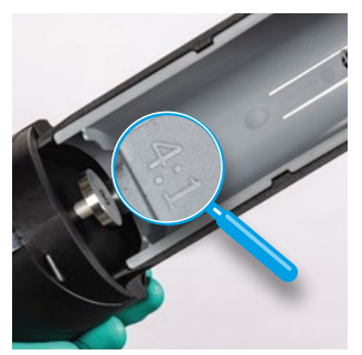
Check the cartridge tray for correct mixing ratio (separately avialble).