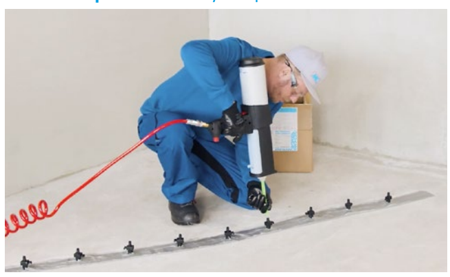
Crack injection with MC-Fastpack 2300 top via MC-Hammer Packer LP 12 into a damp component