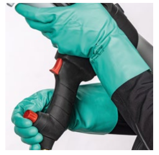
2. Set air pressure limit at regulating valve.