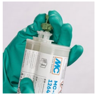
1. Unscrew retaining nut and remove lock washer.