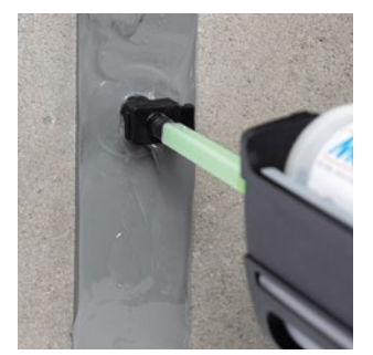
3. Insert mixer nozzle in the packer inlet spigot. Hold firmly in position and press trigger to inject.